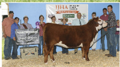
Dam of Lot 12