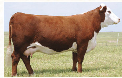
STAR MKS Shiny Pennie 144U Granddam of Lot 42