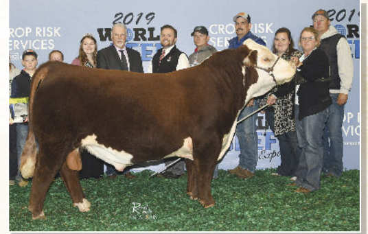
2TK Perks 5101 Cadillac 8039ET Sire of Lots 5, 8 and 9