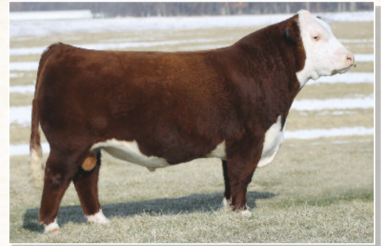
AH JDH Munson 15E ET Sire of Lot 6