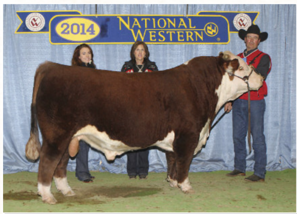
UPS Sensation 2296 ET

Full brother to Lot 39 and sire of Lots 37, 38 and 43