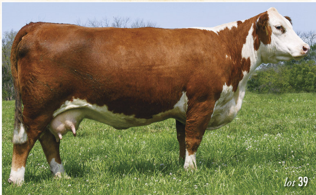
Full sister to UPS Sensation 2296