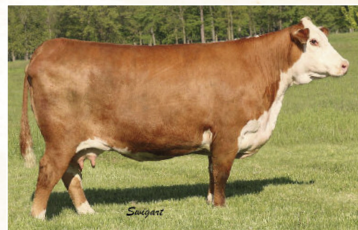
FSL Lady P606 23S Granddam of Lots 19 and 28