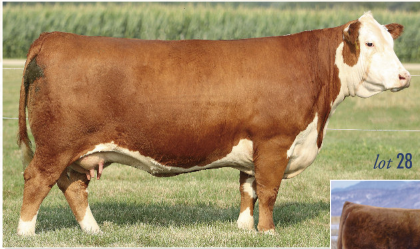
PERKS 0003 Easy Money 4003 Sire of Lot 28