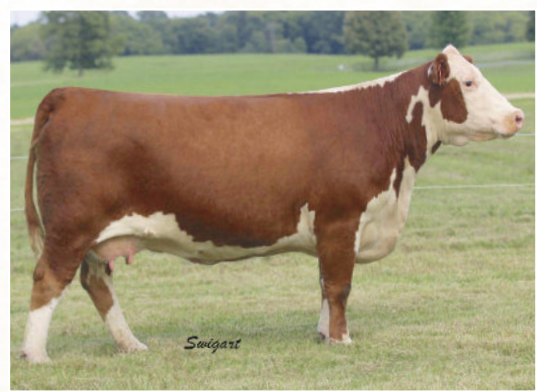
TH 1P 743 Unique 58W Dam of Lots 22 and 23