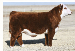
Sire of Lot 39A