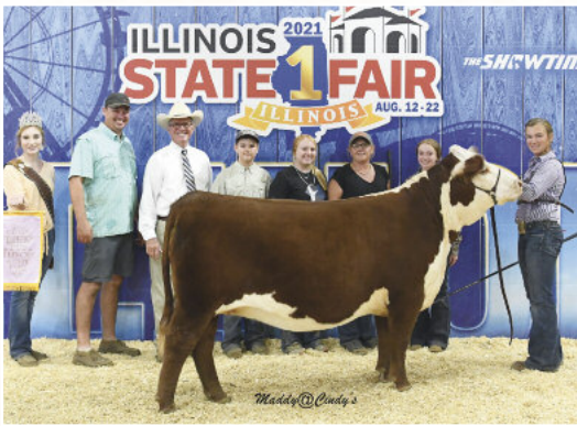
2TK PERKS 5101 Huntley 011H ET Maternal sister to Lot 13