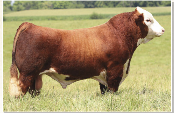
PERKS CATO 4063 Da Bomb 7112ET Sire of Lots 30A and 31A