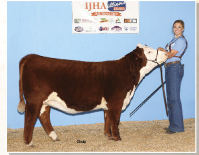
PERKS RF 4Z Luxury 0017 ET Full sister to Lot 5