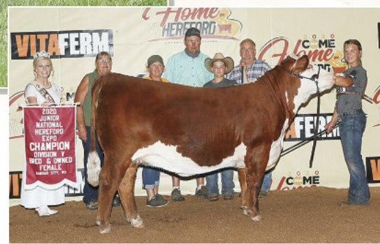
2TK MKS 2296 24B Bella 4G ET Full sister to Lot 43

Lot 43A Heifer calf born Sept. 8, 2021, sired by Loewen CMF Mendel 7G.