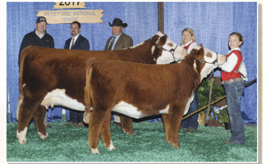
PERKS 2029 Copper Lady 5101 Dam of Lot 13 Also dam of Cadillac and Chuma