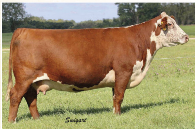
ABRA P606 Ladylove 31Z ET Dam of Lot 40