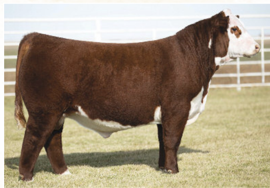
Loewen Genesis G16 ET Full brother to sire of Lot 25A