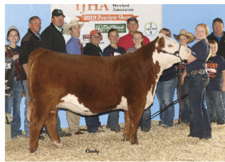
PERKS 1502 Mary Sue 8036 ET Maternal sister to Lot 1... 2019 Illinois Preview Show Champion Polled Heifer