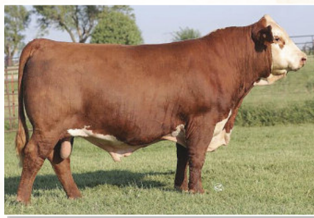
Loewen CMF Mendel 7G Sire of Lot 43A

SAVE THE DATE: March 1, 2022—Perks Ranch Online Bull Sale hosted by SmartAuctions