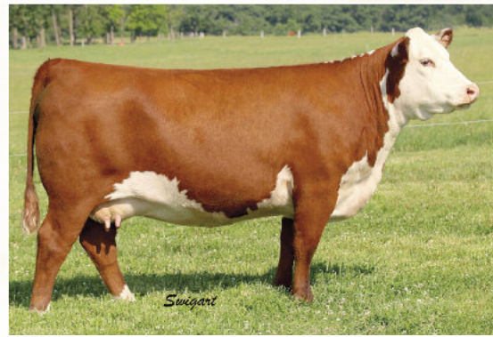
MMK Lady T 1502 Dam of Lot 1