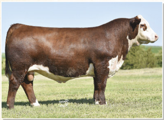
NJW 79Z Z311 Endure 173D ET Service sire on Lots 21 and 22