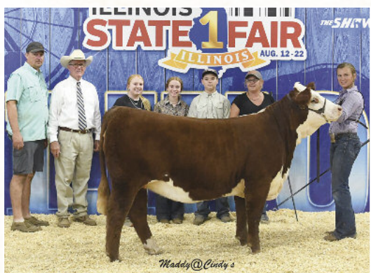
2TK 8061 Vivi 007H Granddaughter of Lot 21