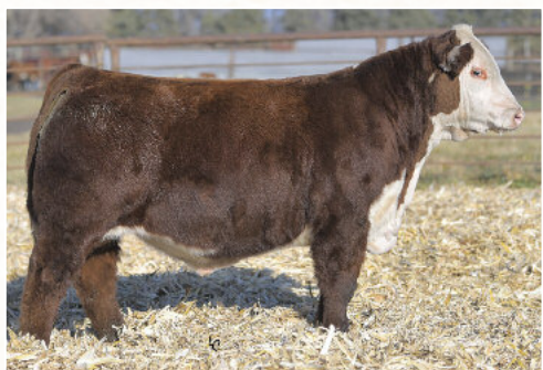
JDH AH Benton 8G ET AI service sire on Lots 36 and 40