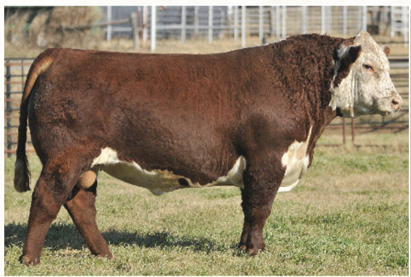
BR SRR C&L Loewen Valiant Pasture service sire on Lots 38 and 41