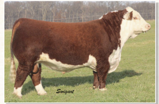
DPH Catapult 1311 ET Sire of Lots 17 and 24