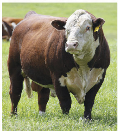
CMF 105X Dr Flash 295D Pasture service sire on Lots 19, 29 and 32