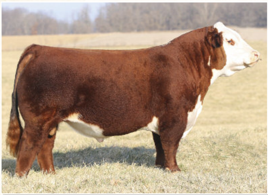
2TK PERKS 5101 Chuma 8184 ET Sire of Lots 20A and 21A