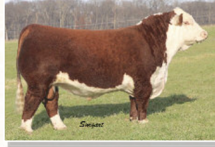
DPH Catapult 1311 ET Sire of Lots 17 and 24