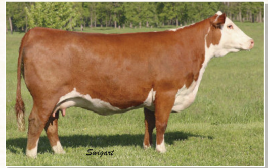
FDM Lady 23S 4Z Dam of Lots 2-6