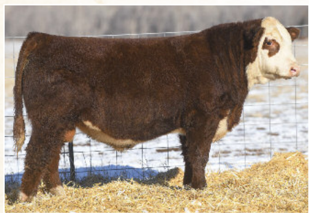
Churchill Broadway 858F Service sire on Lot 42