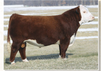
AH JDH Munson 15E ET Sire of Lots 26A, 27A, 28A and 29A