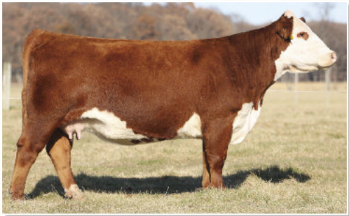
Perks 2026 Lifesaver 5017 Dam of Lots 8 and 9