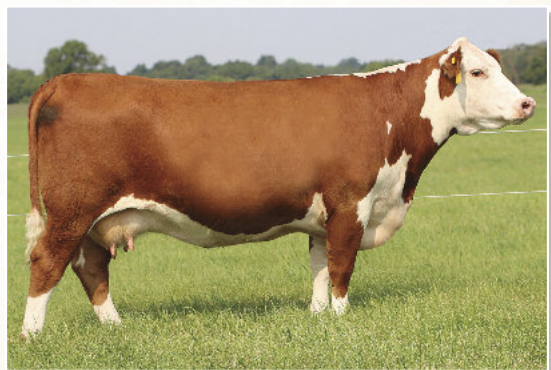
PERKS 172P Queen of Time 4034 Dam of Lots 24 and 25